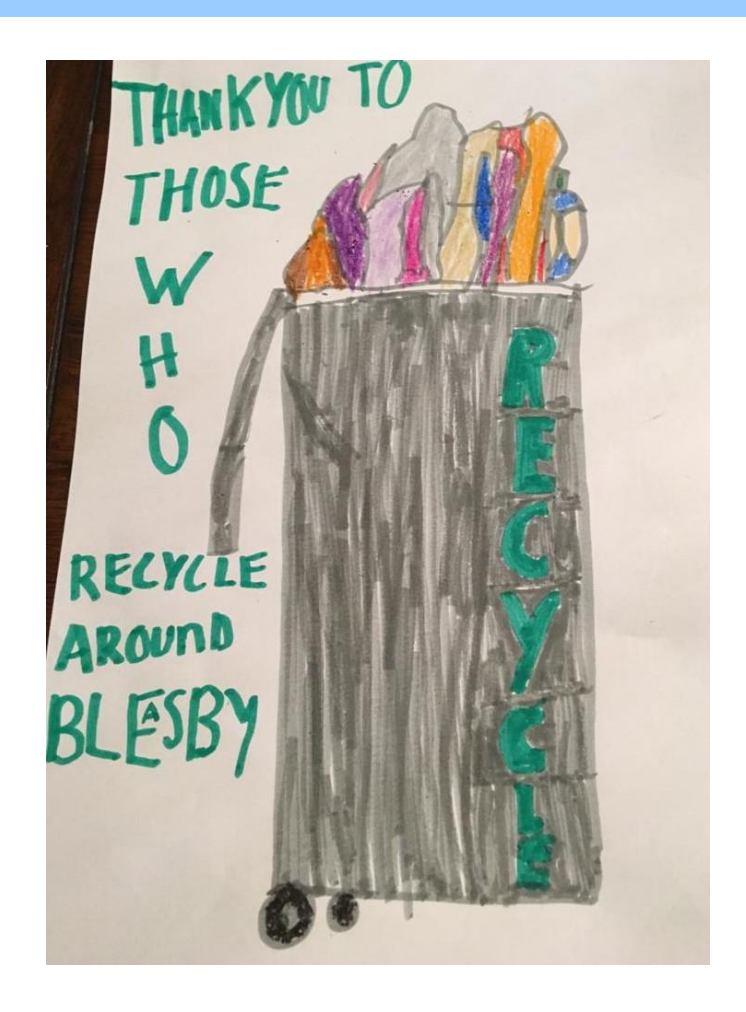
Created by the Green Girls of Bleasby School

01636 830268 or check out our new website <a href="https://www.valleyboardingkennels.com">www.valleyboardingkennels.com</a>